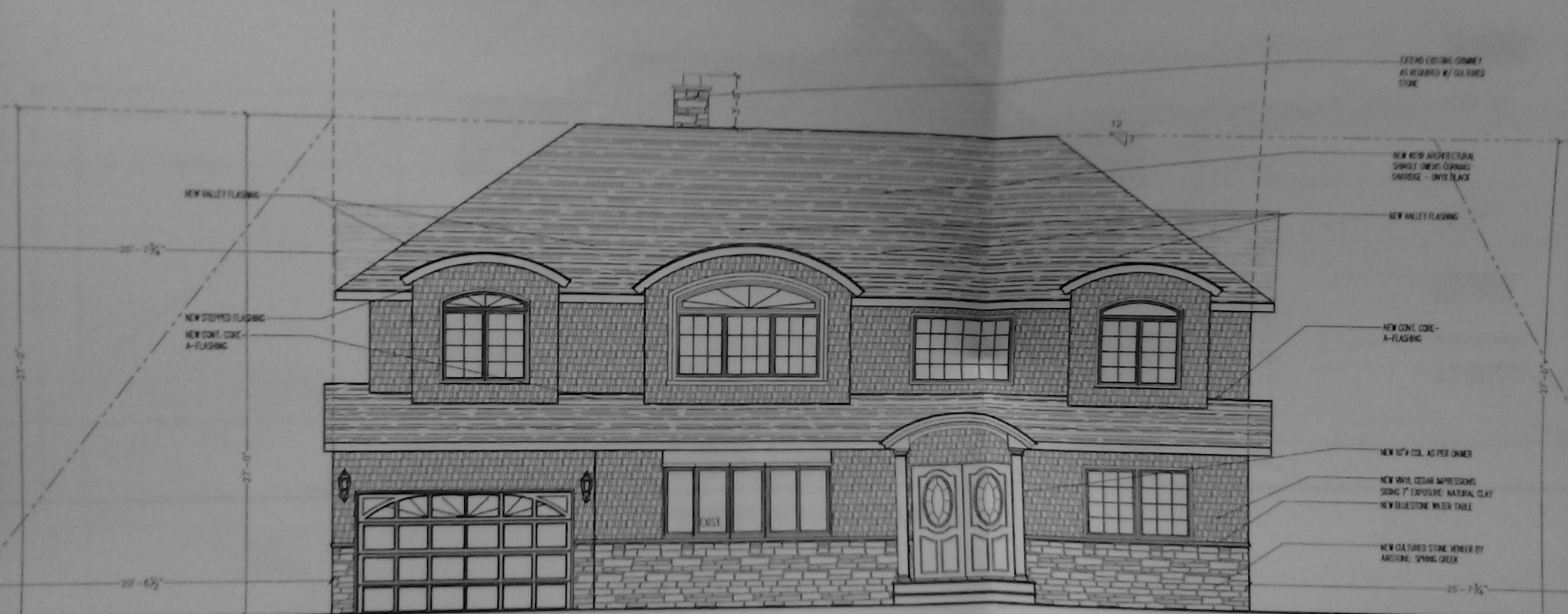
PROPOSED FRONT ELEVATION SCALE 1/4" = 1'-0"